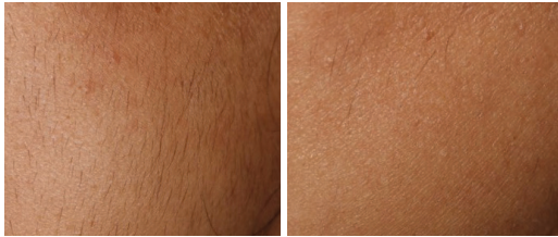
Before and after 1 treatment