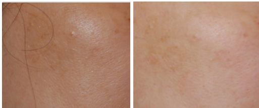
Before and after 3 treatments