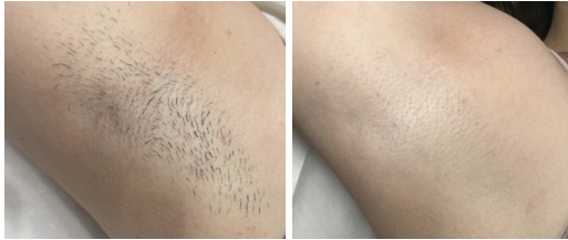
Before and After 3 Treatments